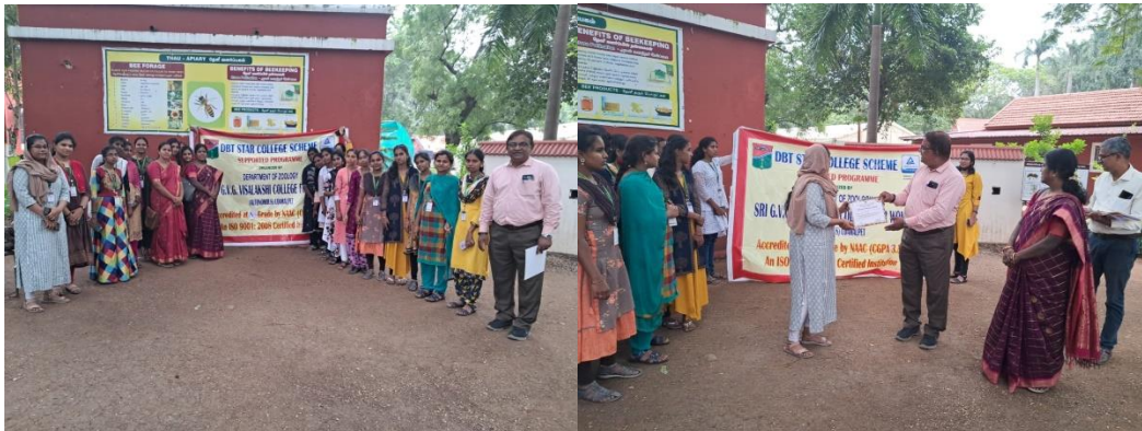
Students Visited Museum