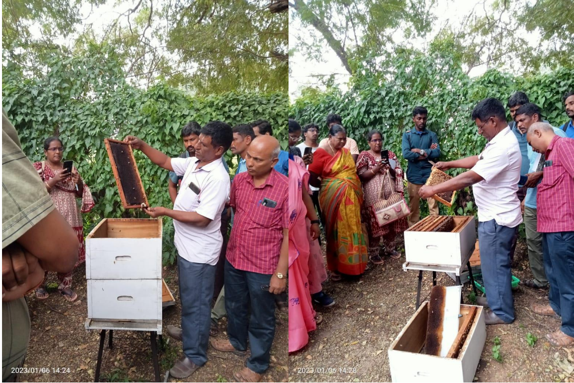
Training Certificate from TNAU to the students