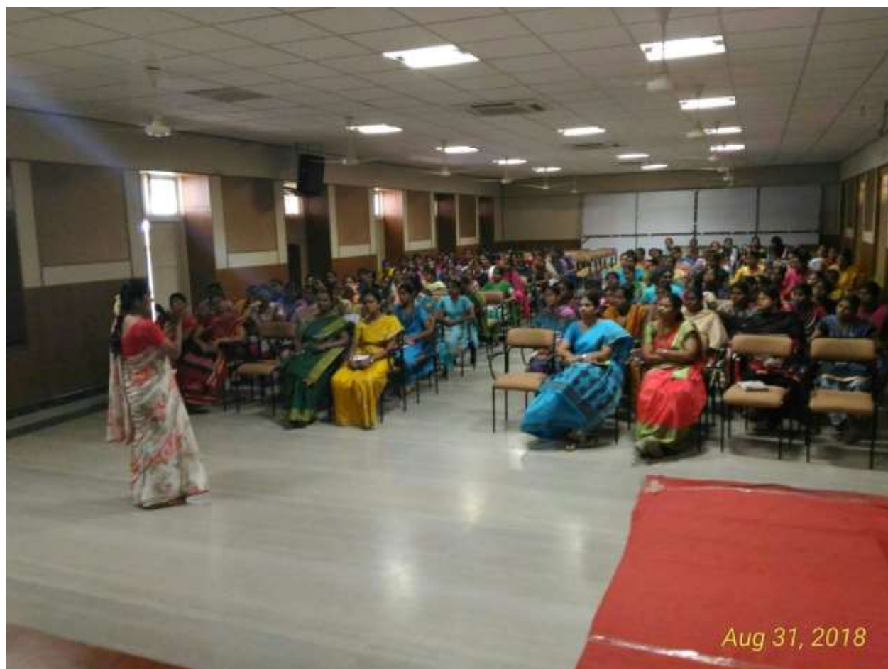
Guest Lecture - Cheminformatics 31.08.2018